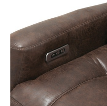
POWER BUTTON WITH USB CHARGER